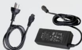
Power Adapter for Portable Repeater PS7502