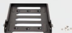
Multi-Functional Installation Bracket BRK17