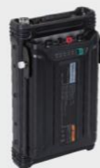
Power Management System PV3001