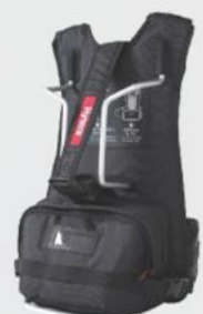
Nylon Backpack (for portable repeater only)(black) NCN010