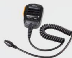
Waterproof Remote Speaker Microphone ( IP67 ) SM18A1

Optional antenna designed by Hytera is highly recommended. *Outdoor use of RD96X with antenna should avoid thunderstorms.